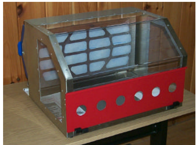
SafeMail™ with emergency door closed

The removable back panel of the unit which includes the HEPA filter and blower, is made of heavy duty, powder coated, galvanized steel. This model is available both as a desktop and portable table mounted unit.